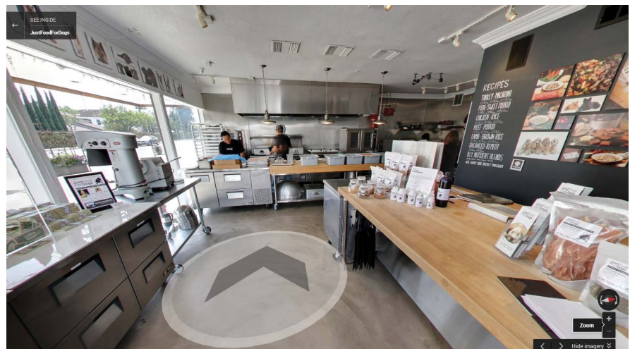
Business View of 'Just Food For Dogs' open kitchen in Newport Beach, California